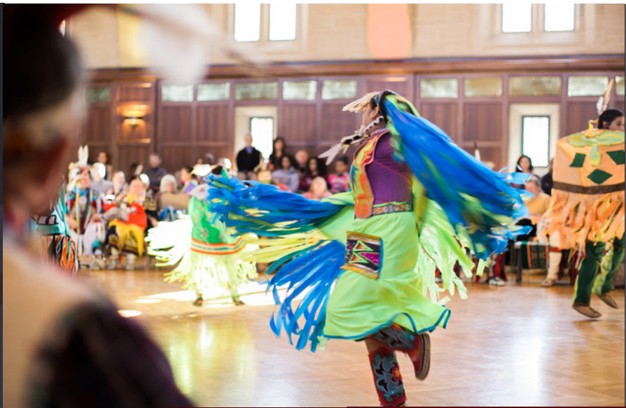
Traditional Native Dancing at the 4 th Annual Powwow

POWWOW 1 IU hosts its 4 th Annual Traditional Powwow in November