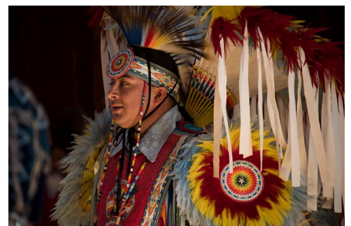
A participant in the powwow's dancing