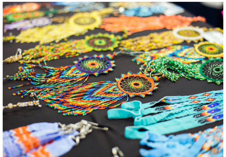
Vendors who sold Native crafts and arts were part of the November 1 st weekend's powwow festivities.